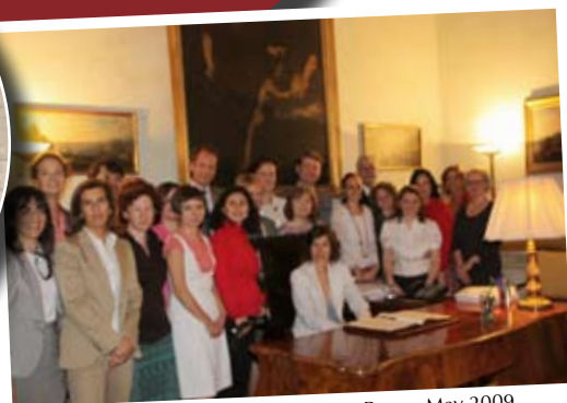
DAFNE Statutes signing session, Rome, May 2009