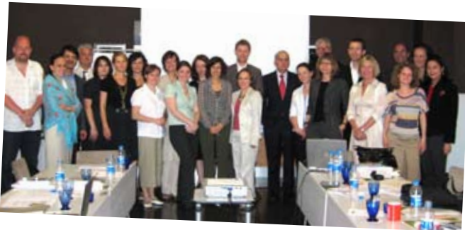
DAFNE Summer Meeting, Istanbul, May 2008

DAFNE is a formal network bringing together 21 donors and foundations networks from across Europe. Each of these individually serves public benefit foundations and other grantmakers at national level. With a collective membership of over 5000 foundations, DAFNE underpins the individual activities of its members by strengthening collaboration between the national associations and providing a platform for exchange of knowledge. The secretariat of DAFNE is hosted by the European Foundation Centre (EFC).