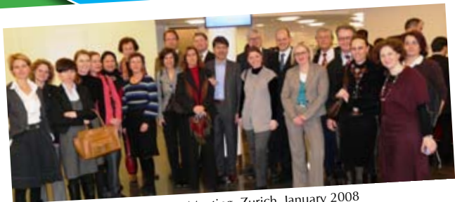
DAFNE Winter Meeting, Zurich, January 2008

In cities and countries around the world, European foundations are running and funding activities in myriad areas – DAFNE members support foundations to ensure their work with beneficiaries is as effective as possible