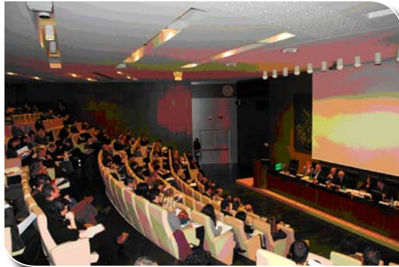
Research Forum on Philanthropy and Research Funding